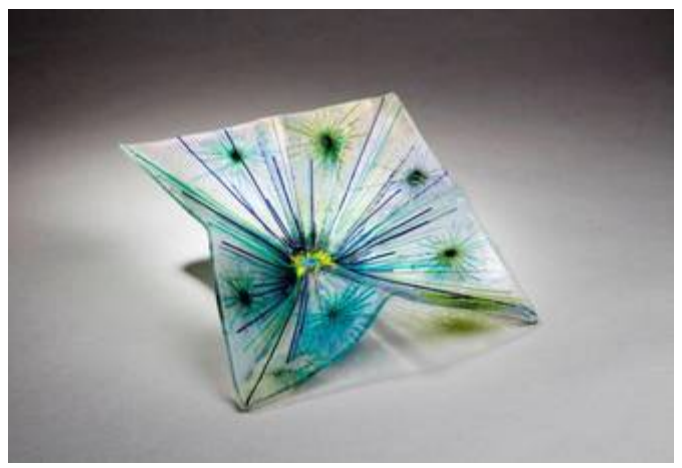
Luminous Burst 2012 Edition 1/5 10.5 x 30 x 29.5 cm

Council House 27 St Georges Terrace, Perth 25 March – 24 May 2013 Free entry, 9:00am - 5:00pm Mon – Fri (closed Easter public holidays)