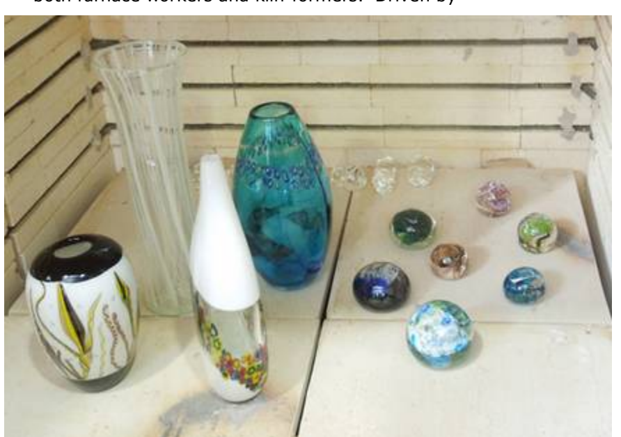
One day's work in the lehr

Essentially, the workshop aims to 'break boundaries' often associated with the respective fields of both furnace workers and kiln-formers. Driven by