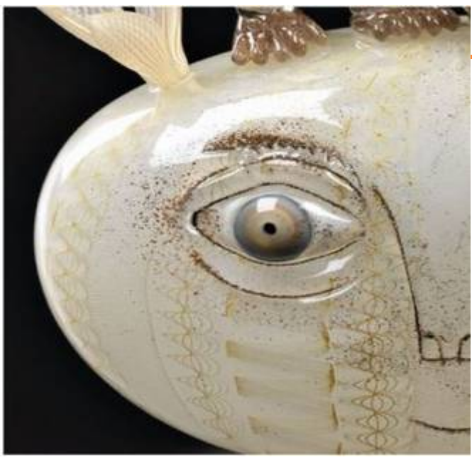
Blown and solid glass 69 x 30 x 17cm