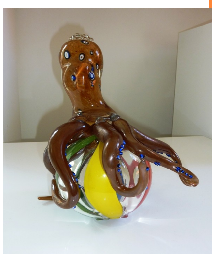
Octopus 2012 From the Octopuses Garden

I hope too that this collaboration helps to generate new collectors who either young or old have a renewed appreciation for glass.