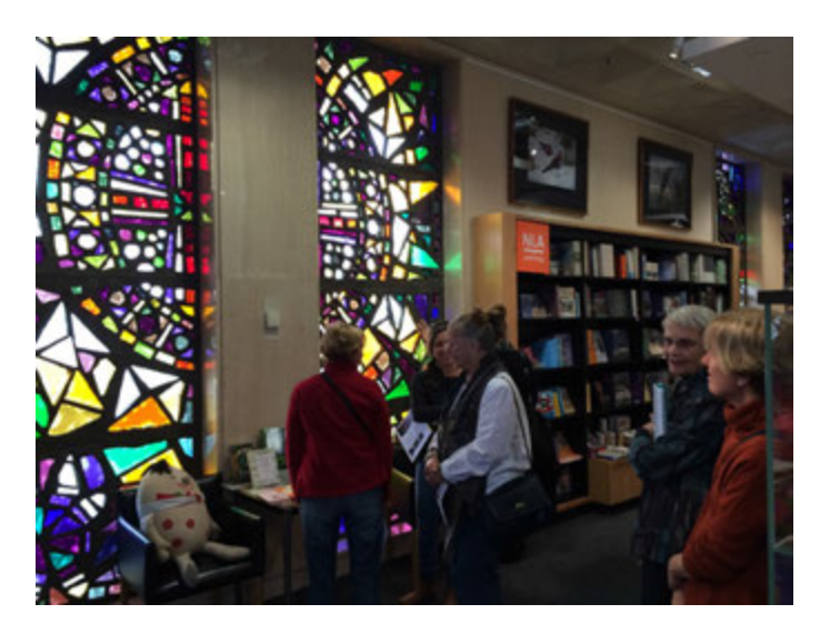
ACT members visit the Leonard French windows at the National Library of Australia

session. This is a great honour, and fabulous to hear an Aussie will take up this role.