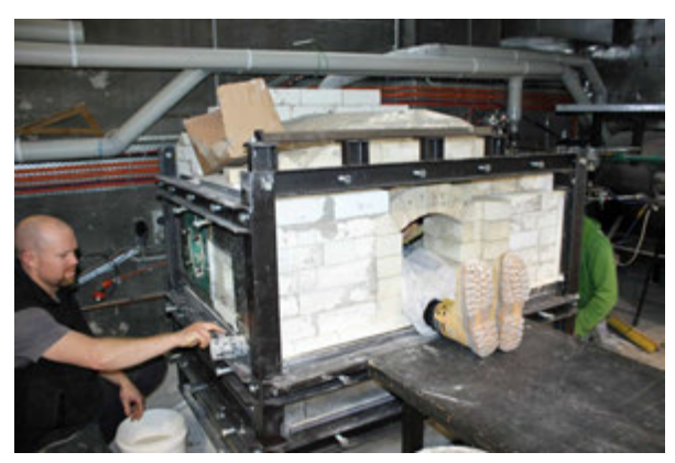
working on the Glassworks tank furnace rebuild

Many artists from Canberra have headed overseas during June/July and Canberra Glassworks wishes them safe travel.