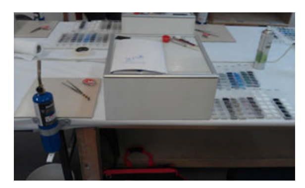
ready to attempt the di Fiore technique

Glass studio in April. 'Intensive' was the operative word as students tried over five long days to soak up at least some of her