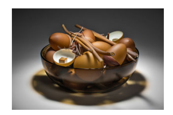
bowl of plenty (gold) by Nick Wirdnam

Nick Wirdnam will be presenting a solo exhibition Beliefs, at Beaver Gallery (21 Aug - 9 Sept): 'Often drawing on cultural beliefs, personal circumstance or experience, we develop systems which offer comfort and security. We invest value in symbols and objects which protect us from misfortune and provide hope and promise. This work employs familiar objects with an historical association of good fortune, hope and consolation.'