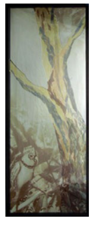
The Life Between