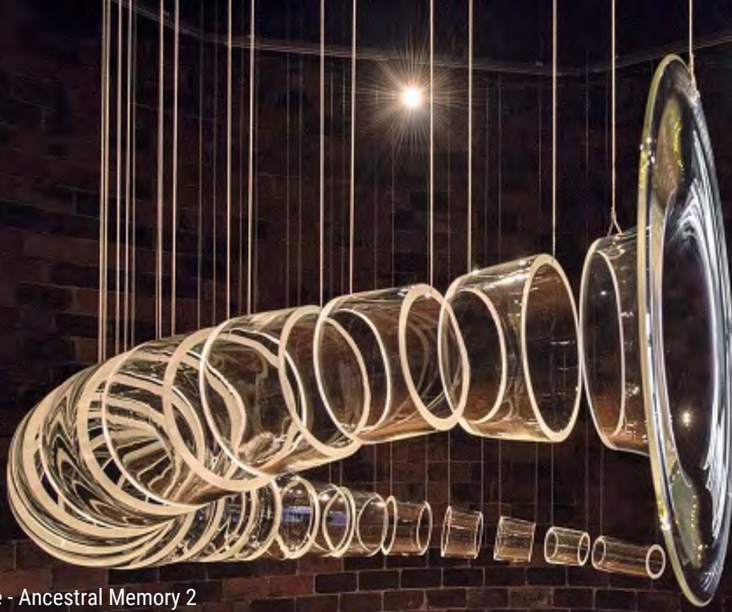
Maree Clarke - Ancestral Memory 2