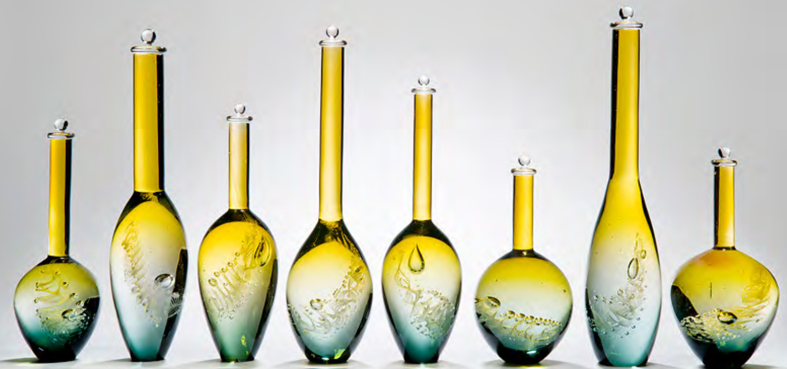
Louis Thompson - Archive of DNA