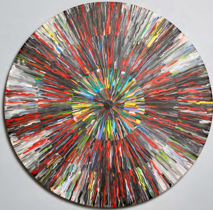
Brendan Scott French - Speedwheel 1