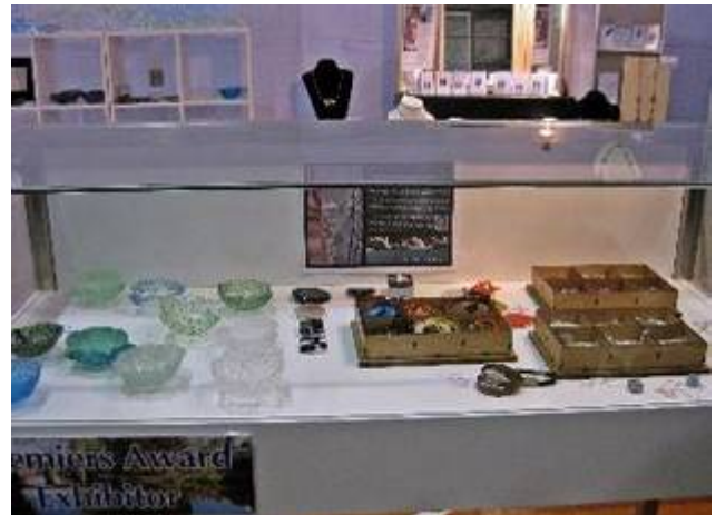
Some of Christine's work on display