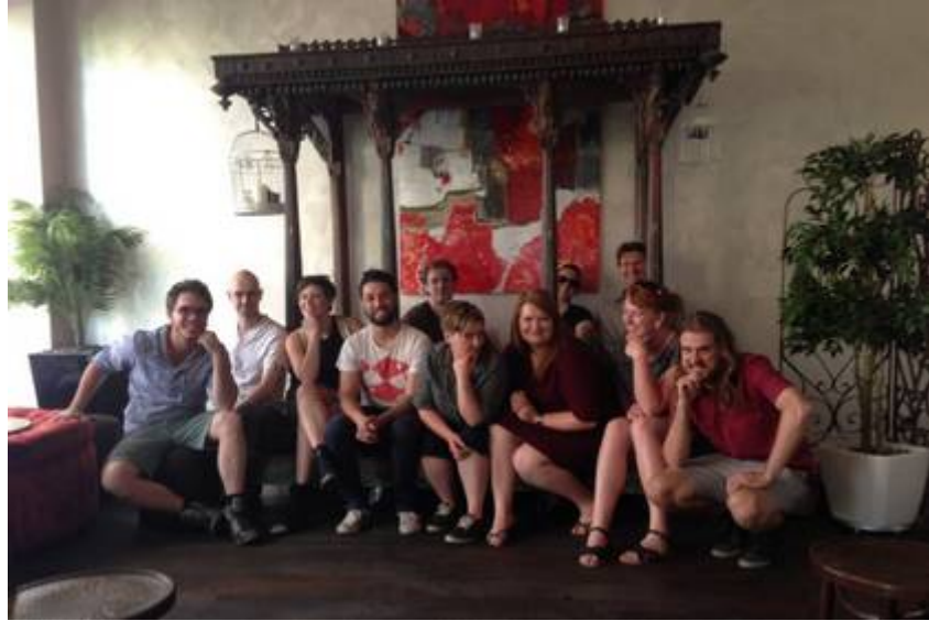
The team at the JamFactory

For more details see http://www.jamfactory.com.au/now-showing.php