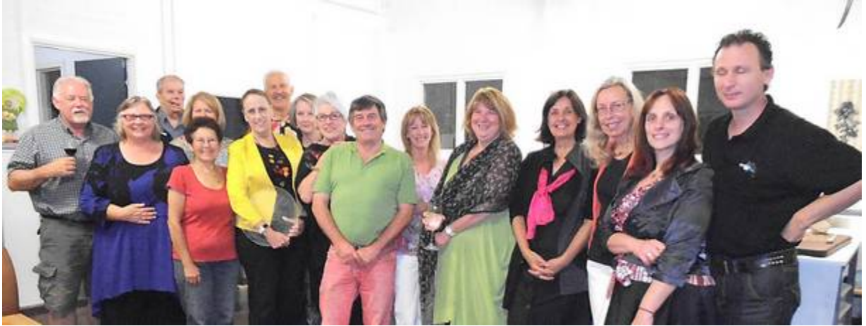
The WA Christmas party

Greg Ash has a solo exhibition entitled Glass Eclectica at the Mill Gallery in York from 4 December to mid January with wall pieces, sculptures and functional glass.