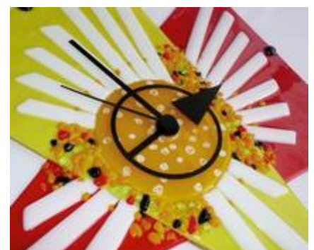
V & A Glass 2012