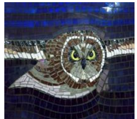
Lucy Cleary 2012