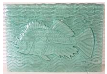
Vicki Crowley-Clough 2011