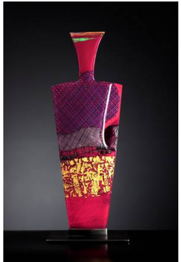
Sentinel Vase 01_2004 800 mm High

They blogged him with “King creates glassblown landscapes on some of his works that are similar to that of watercolor or oil paintings. Each work is classic and beautiful with patterns and designs that are combined to produce unique stories in their own way but has an overall theme of nature that we love.”