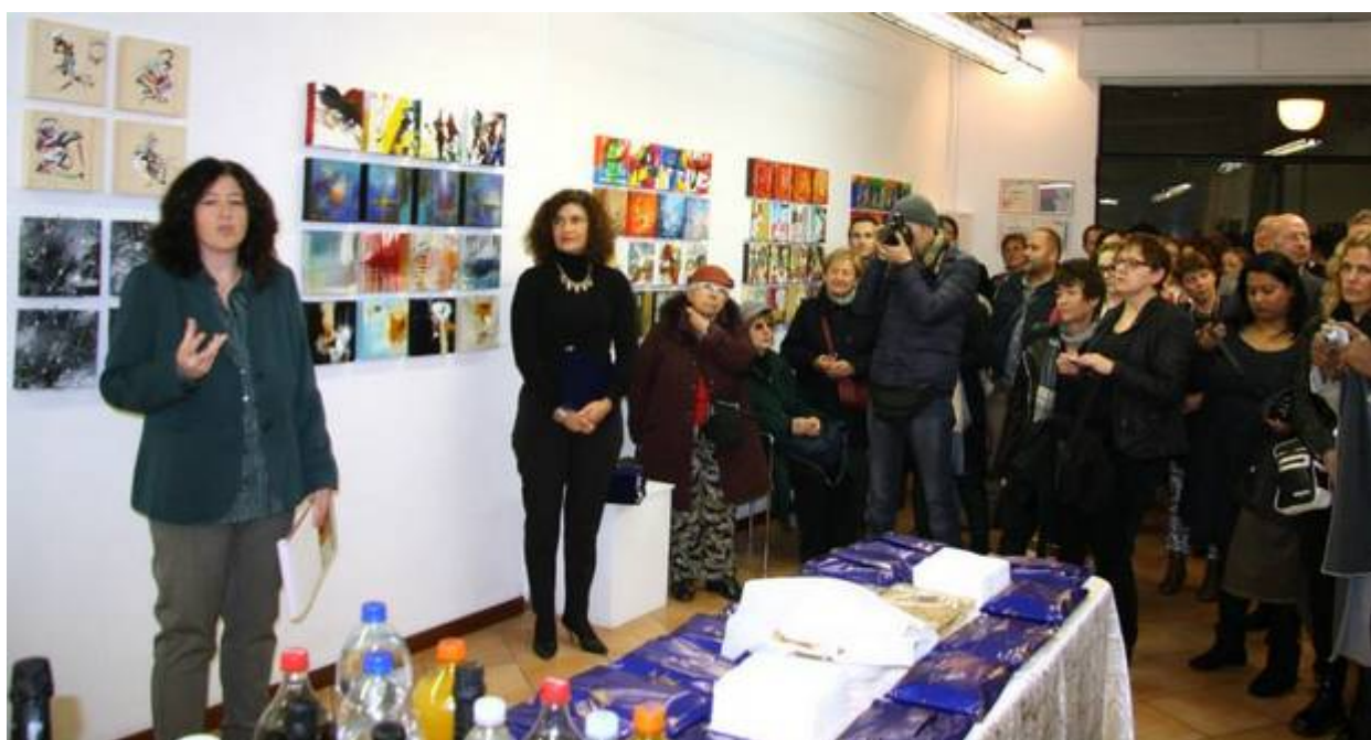
The exhibition opening in Bologna