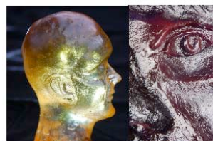
Max Klubal Cast and blown figurative work