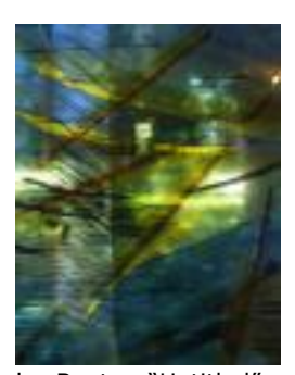
les Baxter "Untitled"